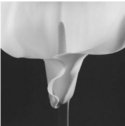
Calla Lily, 1988

Robert Mapplethorpe, American, 1946-1989. Gelatin silver print. Jointly acquired by the J. Paul Getty Trust and the Los Angeles County Museum of Art, with funds provided by the J. Paul Getty Trust and the David Geffen Foundation, 2011.9.26. © Robert Mapplethorpe Foundation.