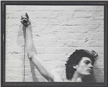
Identical self-portraits of Robert Mapplethorpe with trip cable in hand, 1974

Additionally, during the run of "Robert Mapplethorpe: The Perfect Medium" the Getty Museum's Center for Photographs will also feature the exhibition "The Thrill of the Chase: The Wagstaff Collection of Photographs." Sam Wagstaff's impressive collection of photographs that was acquired by the Getty Museum in 1984 is one of the cores of the collection of the Department of Photographs. This exhibition and accompanying publication of the same name is an opportunity to focus on Wagstaff's collection and his role as one of the most important patrons and collectors of photography.