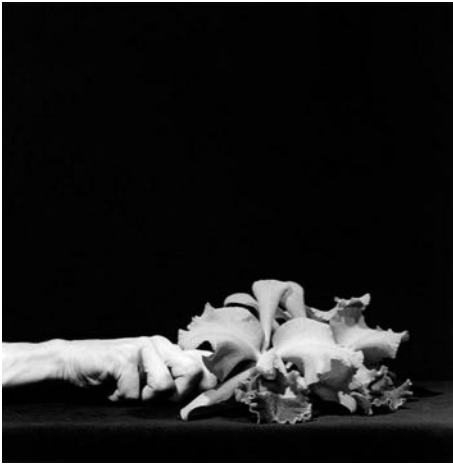
Orchid and Hand Robert Mapplethorpe, 1983 20" x 16", silver gelatin print